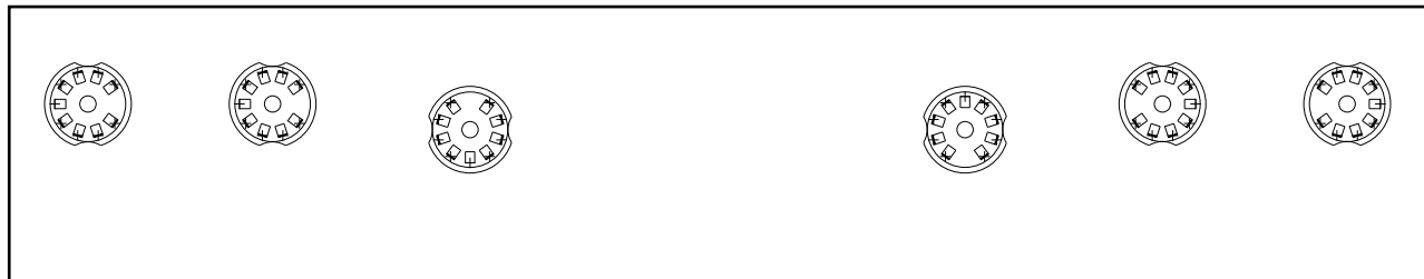
RIAA amp board